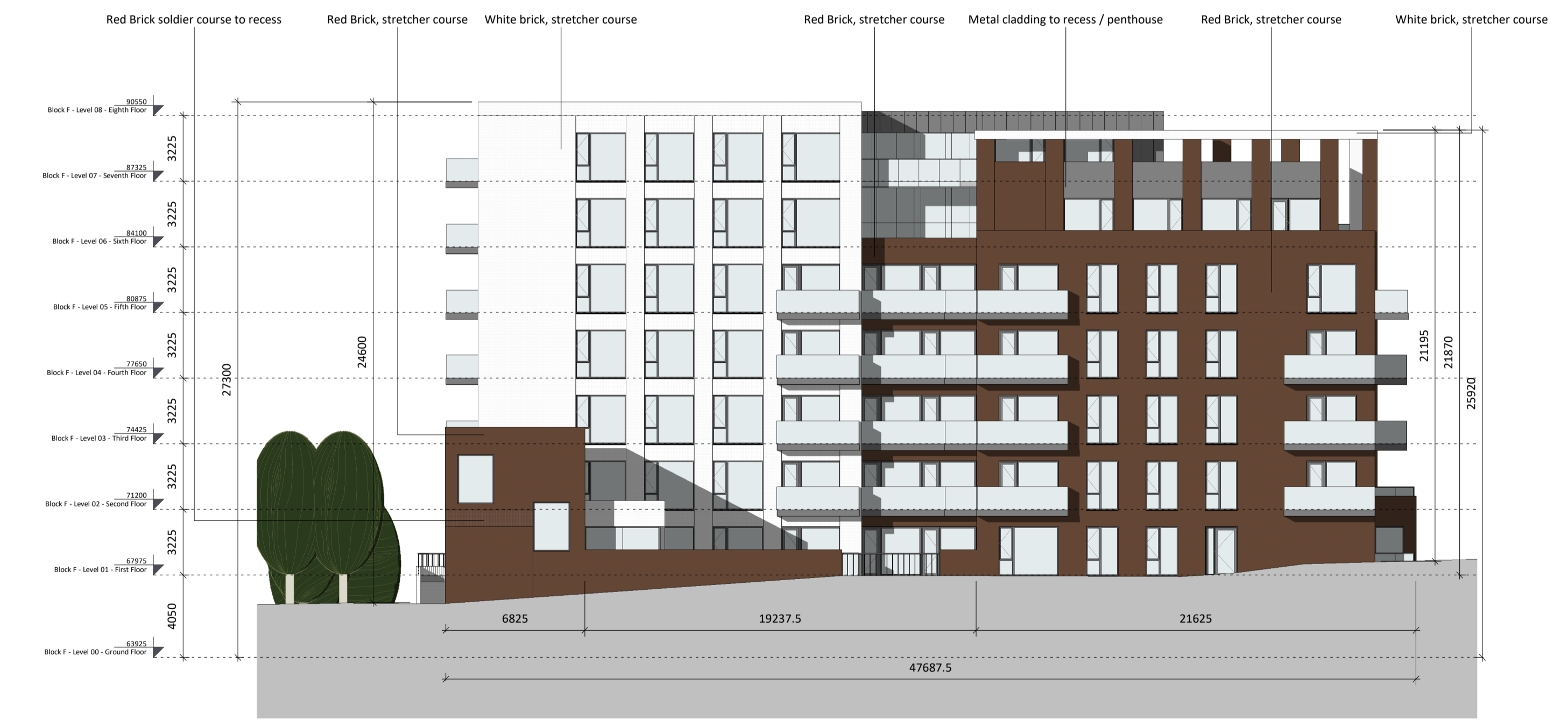
③ Block F SE Elevation 1: 200