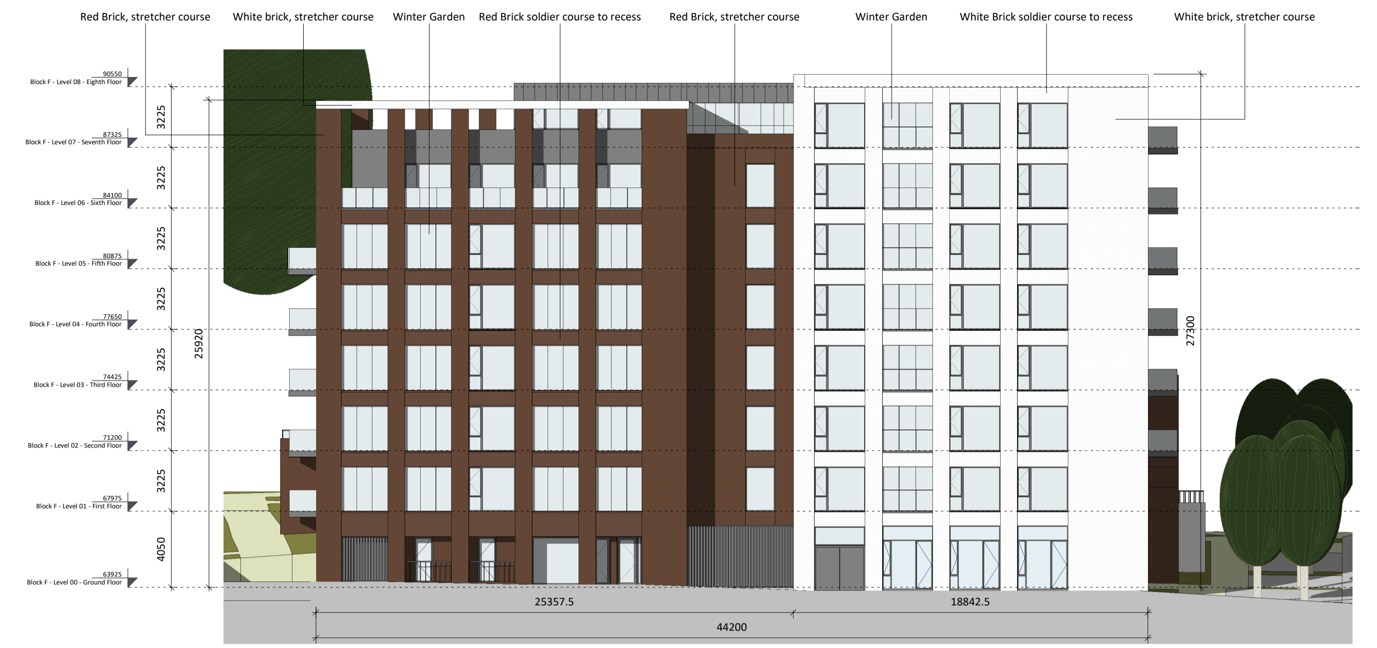
② Block F NW Elevation 1: 200